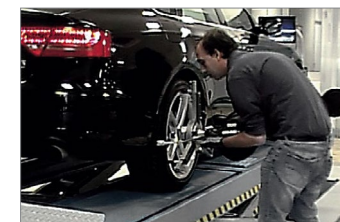
3 point + quick locking system for quick setup.