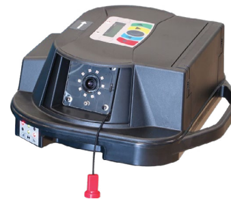
High resolution megapixel camera.