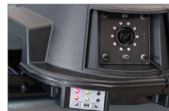
LED repeater for guided measurements without monitor.