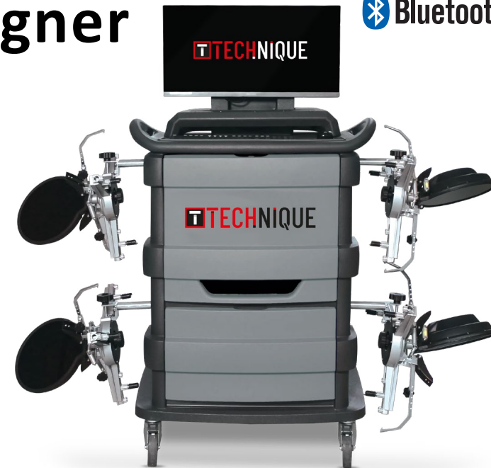
Control center complete with printer, keyboard, and mouse.